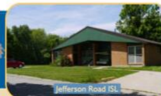
Jefferson Road ISL