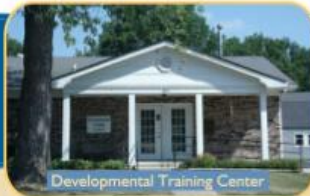
Developmental Training Center